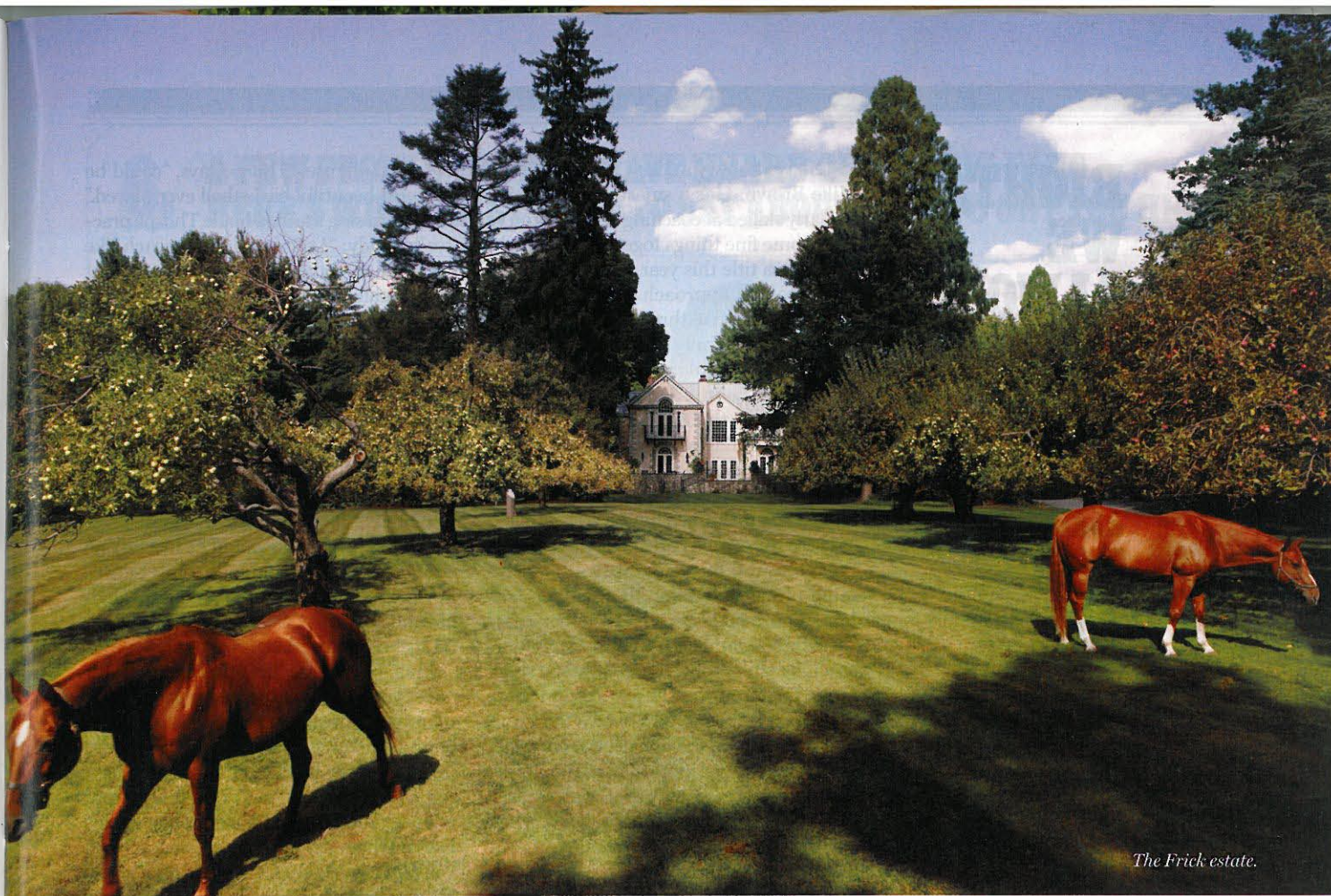
The Frick estate.