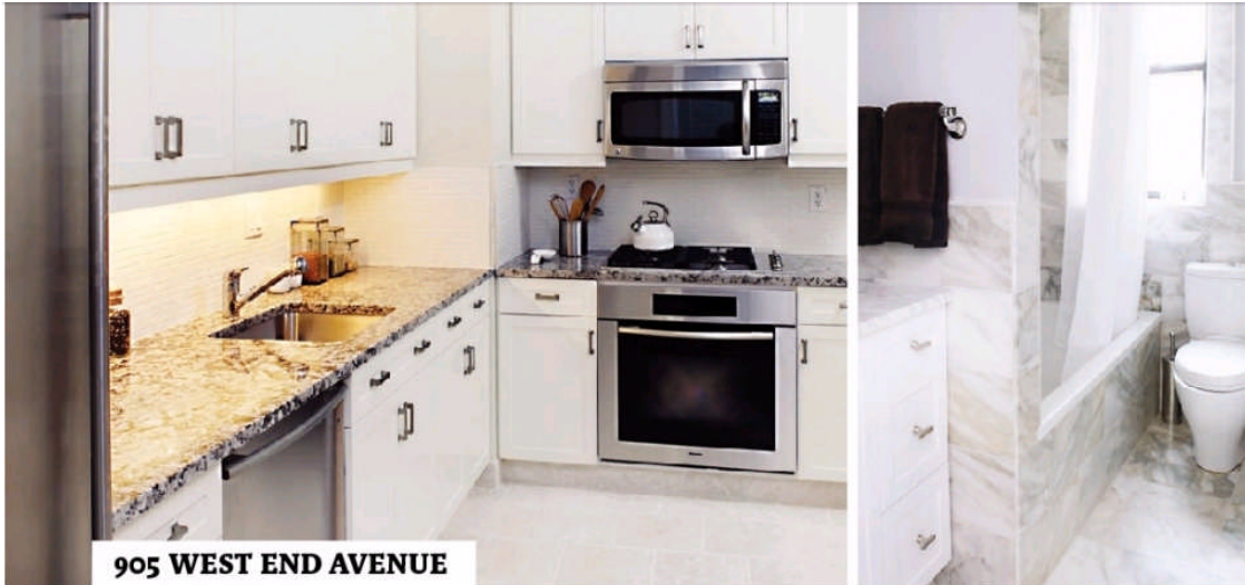
905 WEST END AVENUE