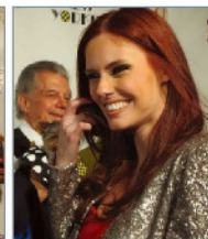
Host Alyssa Campanella, Miss USA 2011