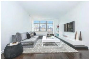
West Village Luxury at Morton Square.

“I sell what I love and love what I sell. I live the very lifestyle that I am selling—and have done so for the past two decades.”