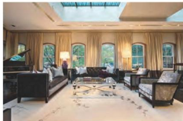
Urban Mansion at 2 North Moore Street.