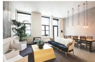
NoHo/Nolita Designer Loft.