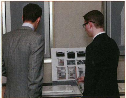
Viewing the displays