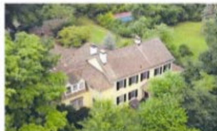
The current owner of this six-bedroom West Hills farmhouse found a cannonball on the property.