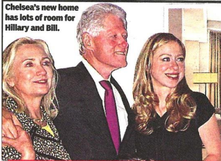
Chelsea's new home has lots of room for Hillary and Bill.

http://www.nydailynews.com/life-style/real-estate/madison-sq-park-condo-attracts-big-names-chelsea-clinton-article-1.1324579?localLinksEnabled=false